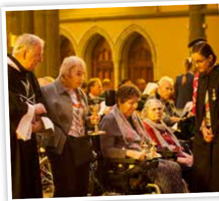
Melbourne picture courtesy of Kairos Catholic Journal/Casamento Photography